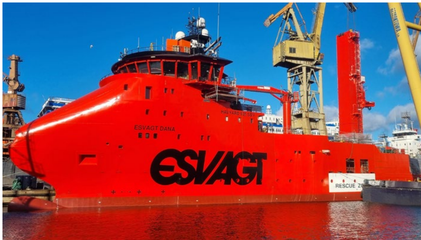
Installation of the SMST's Access & Cargo Tower on the ship's deck